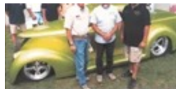
This is a street rod pickup that was built by Tucci Hot Rods in Marcy, NY, as the 2004 give away car at the Syracuse Nationals. Tucci is on